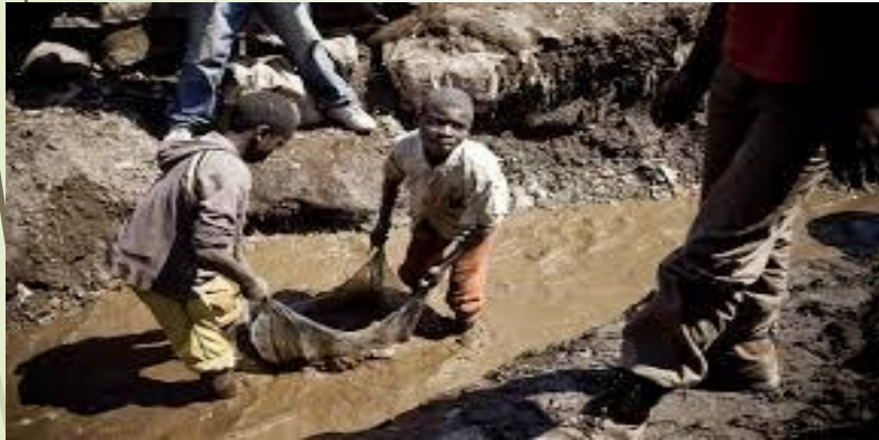
Ashanti children Ghana – Illegal Mining