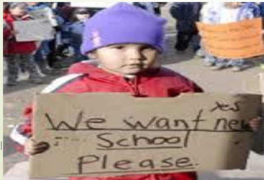
First Nation Aboriginal Canada - Neglected from Education