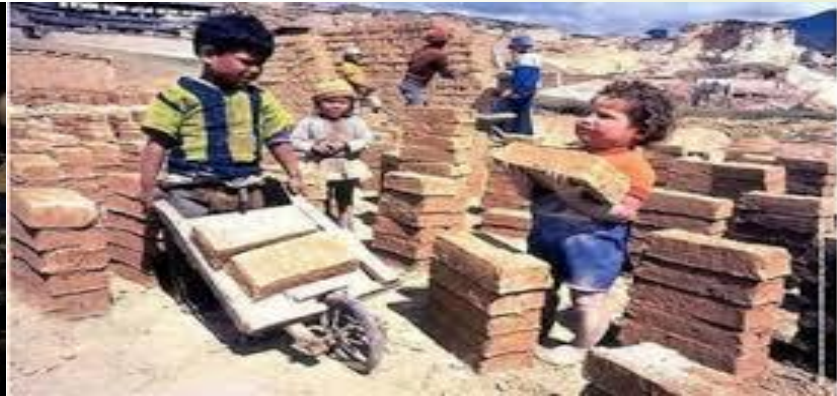
Aymara children Peru- child labour